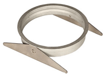
Trim Kit for Existing Ceilings